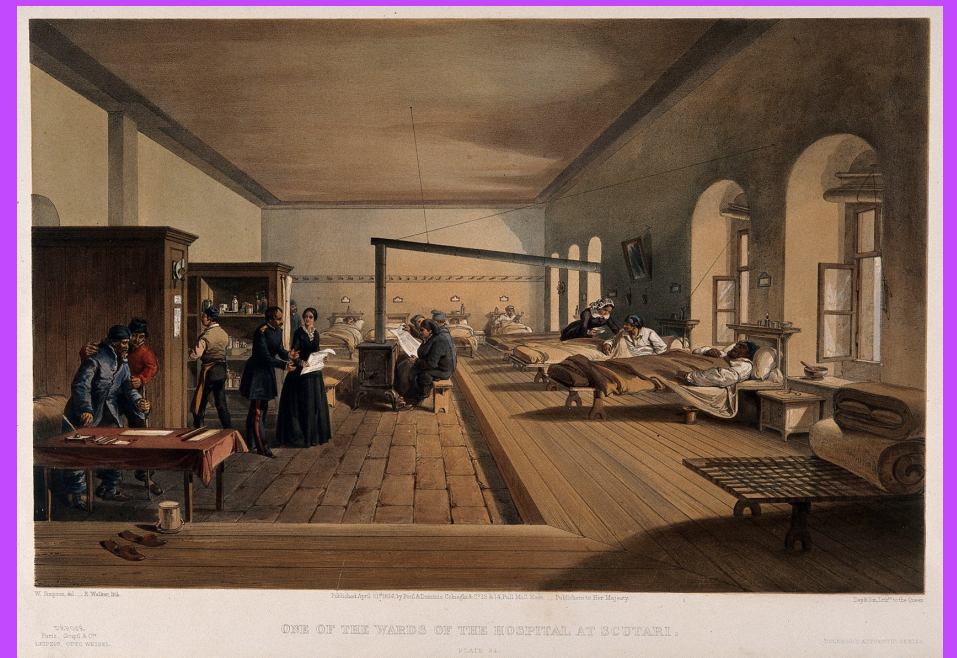
ONE OF THE YARDS OF THE HOSPITAL AT SCUTARI.

Florence was called Lady of the Lamp by the soldiers because she checked on them in the middle of the night with a lamp.